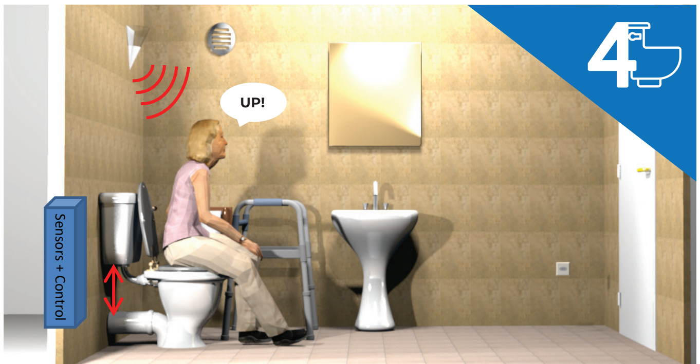
Toilet4me concept: Toilet room with automatically adjustable and ICT enhanced toilet

The business model to be developed aims at a modular product with scalability and customisation of the functionality and services according to the individual customer's needs and wishes.